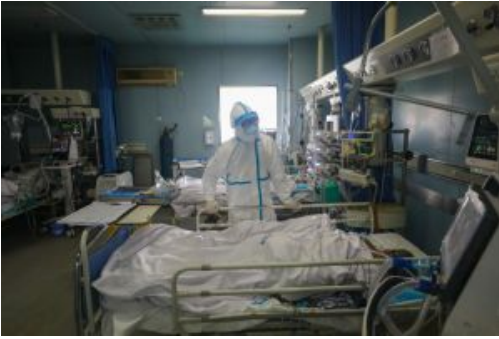
Most coronavirus infections are mild, says Chinese study