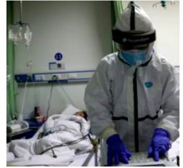
Wuhan hospital director dies second prominent doctor to coronavirus

Have a question on the coronavirus outbreak? E-mail us at askst@sph.com.sg